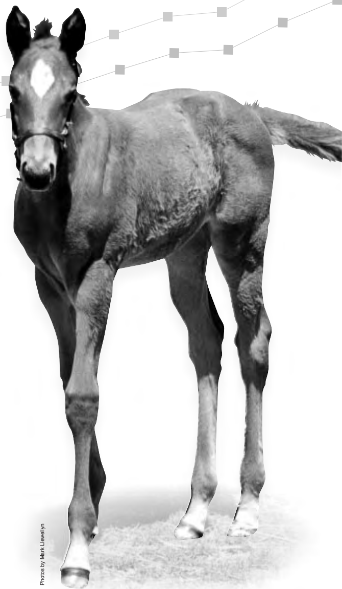
Projected Growth Parameters for a Young Horse

Radiographic studies on the acquisition of bone mineral in horses from one day of age to 27 years have shown that maximum bone mineral content (BMC) is not achieved until the horse is six years old. If the rate of mineralization of the cannon bone and age are compared, a pattern emerges that is more similar to that of weight gain than height. At six months of age horses have attained 68.5% of the mineral content of an adult horse, and by one year of age they have reached 76% of maximal BMC. Bone is a much more dynamic